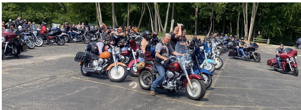
Riddy Run, 2023