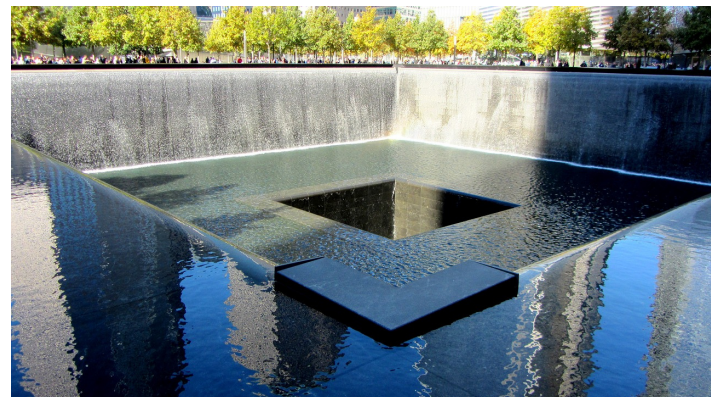
National September 11 Memorial and Museum

Although I feel the day was a success, I would have liked to see MUCH more participation from our members. Memorial Day was a perfect opportunity to show the city and community what the American Legion stands for, and why we should be included in the city's services honoring Veterans and active military throughout the year. As an organization of over 900 members, including Veterans and their families, we have a unique opportunity to be a large presence in the community, and to promote the main objective of the American Legion Family, SERVICE OVER SELF. The next time your Post asks for volunteers, ask yourself, "What am I able to do to help our cause?"