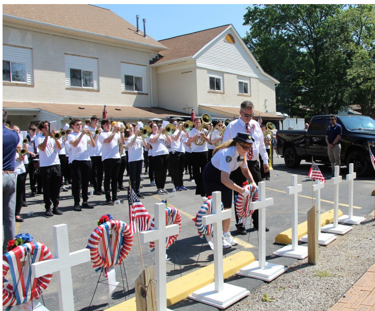
Wreath Ceremony, Memorial Day, 2023