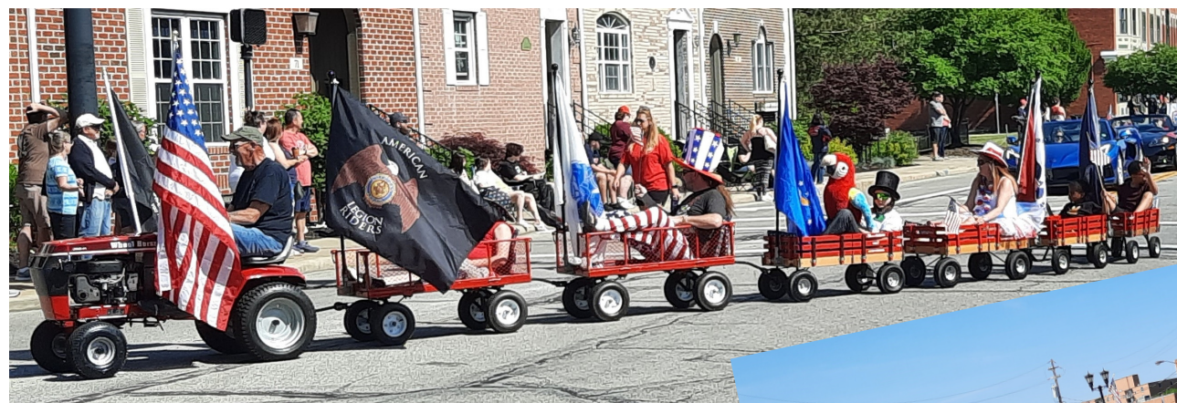
American Legion Riders, Memorial Day Parade, 2023