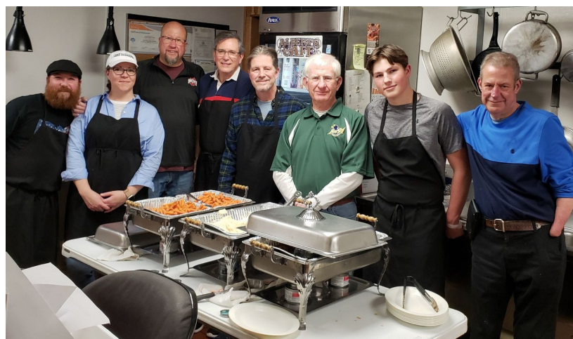
SAL Veterans Day Dinner, 2023 Volunteers