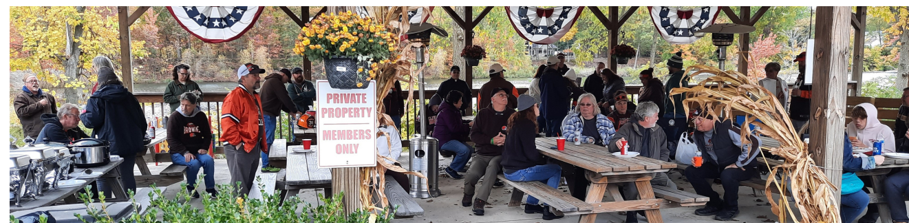
SAL Tailgate Party October, 2023