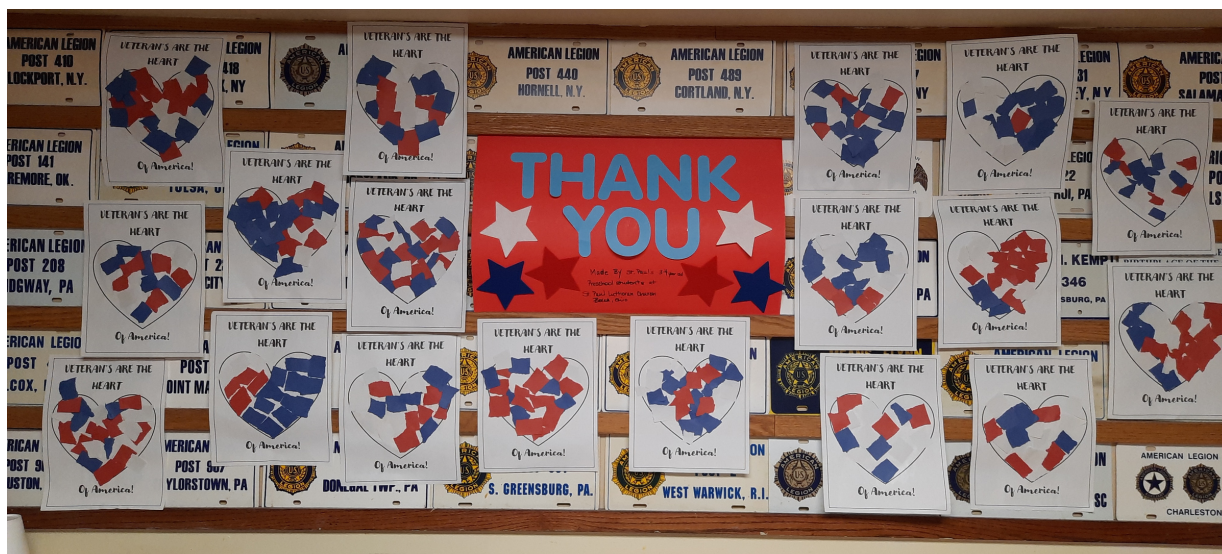
“Veterans are the Heart of America Artwork” in honor of Veterans Day by Preschoolers at St. Paul Evangelical Lutheran Church in Berea