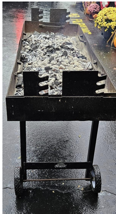
Clam Bake, 2023