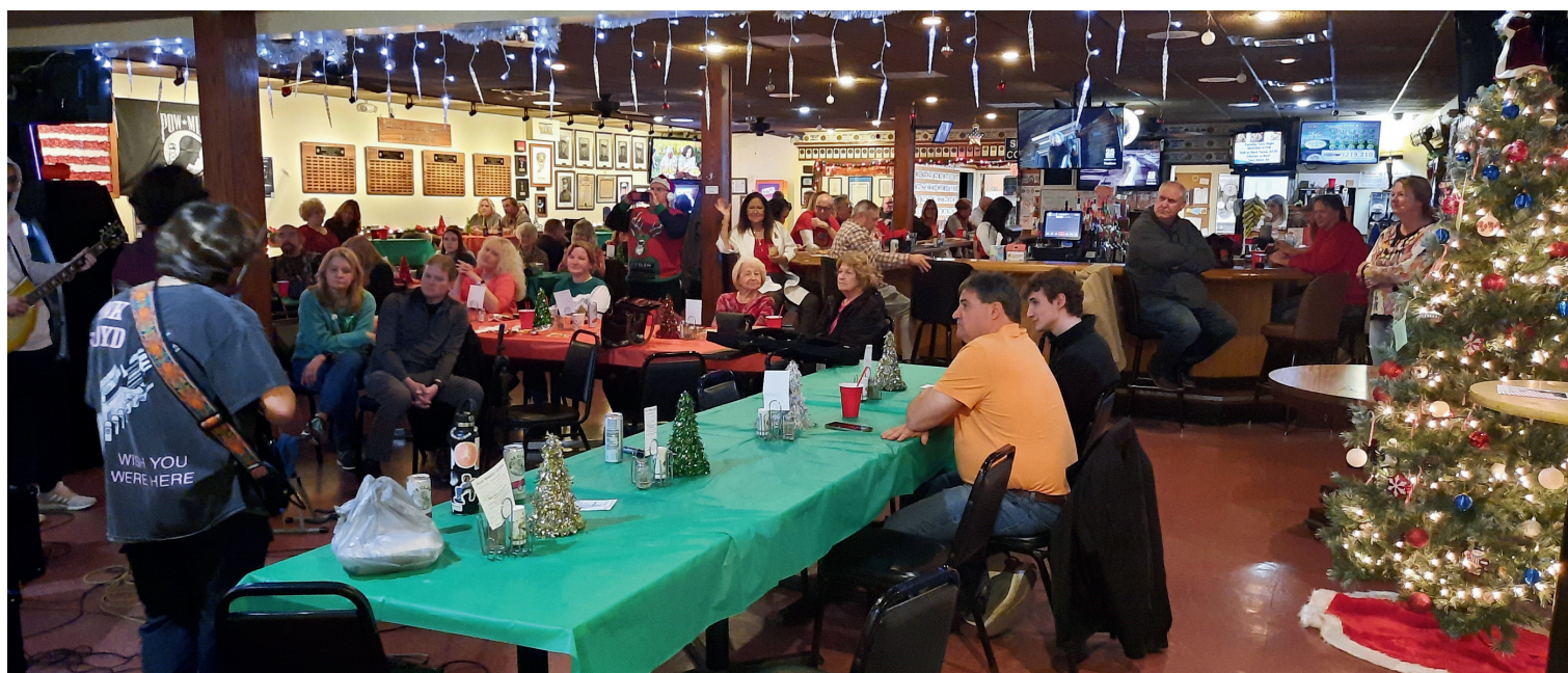
Canteen Christmas Party, 2023