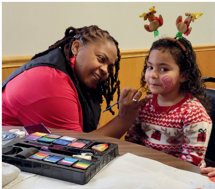
Kids Christmas Party, 2023