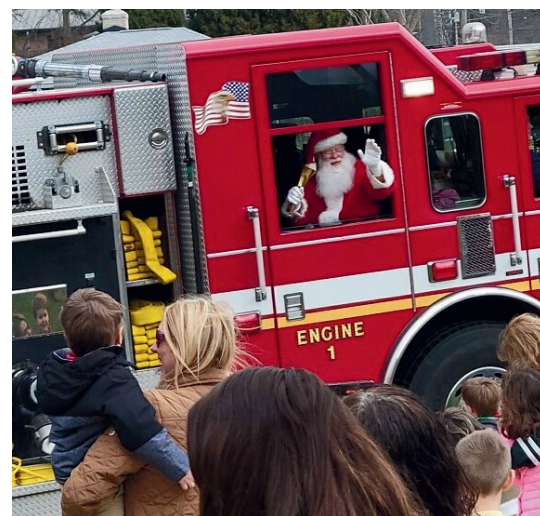
Santa arriving at the Auxiliary Kids Christmas Party in a fire engine rather than a sled, 2023