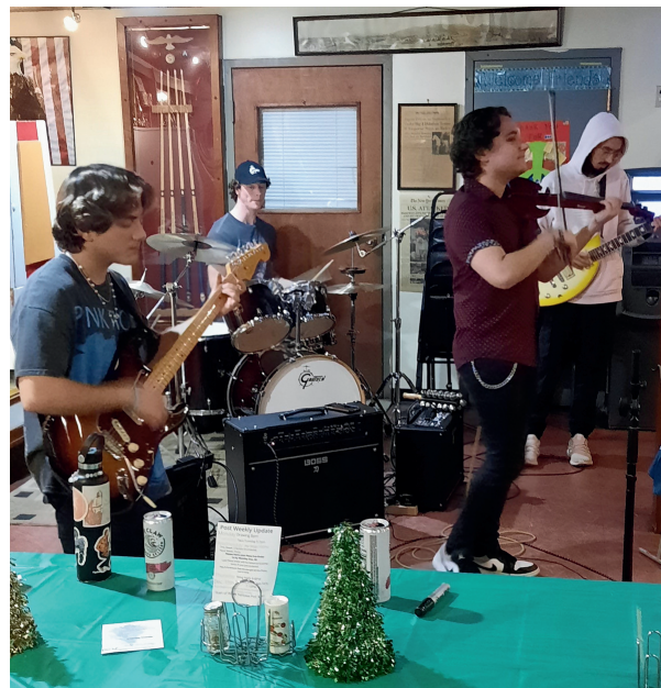
Band: Bridge the Gap Canteen Christmas Party, 2023