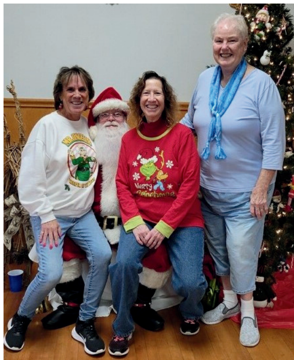
Even the big kids got to sit on Santa's lap