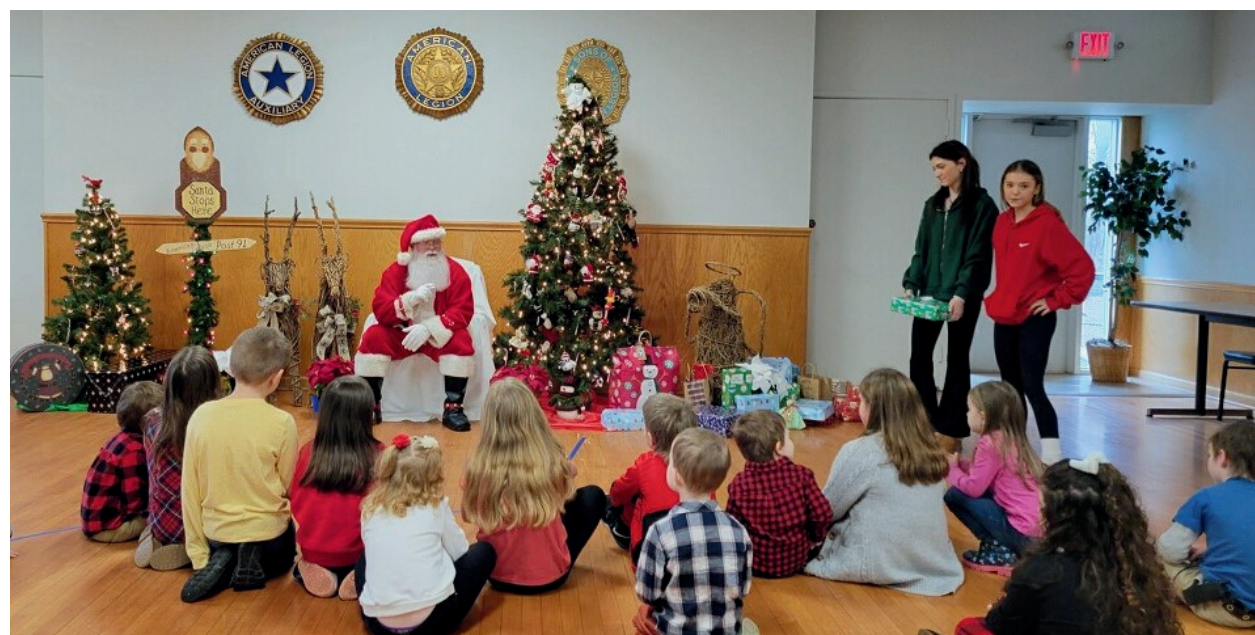
Auxiliary Kids Christmas Party, 2023