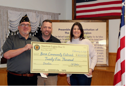
Blue Caps Presenting Donation Checks to Berea Community Outreach and Berea Rescue Fund, 2024