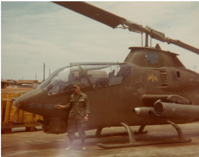
Trapper and a Cobra Helicopter