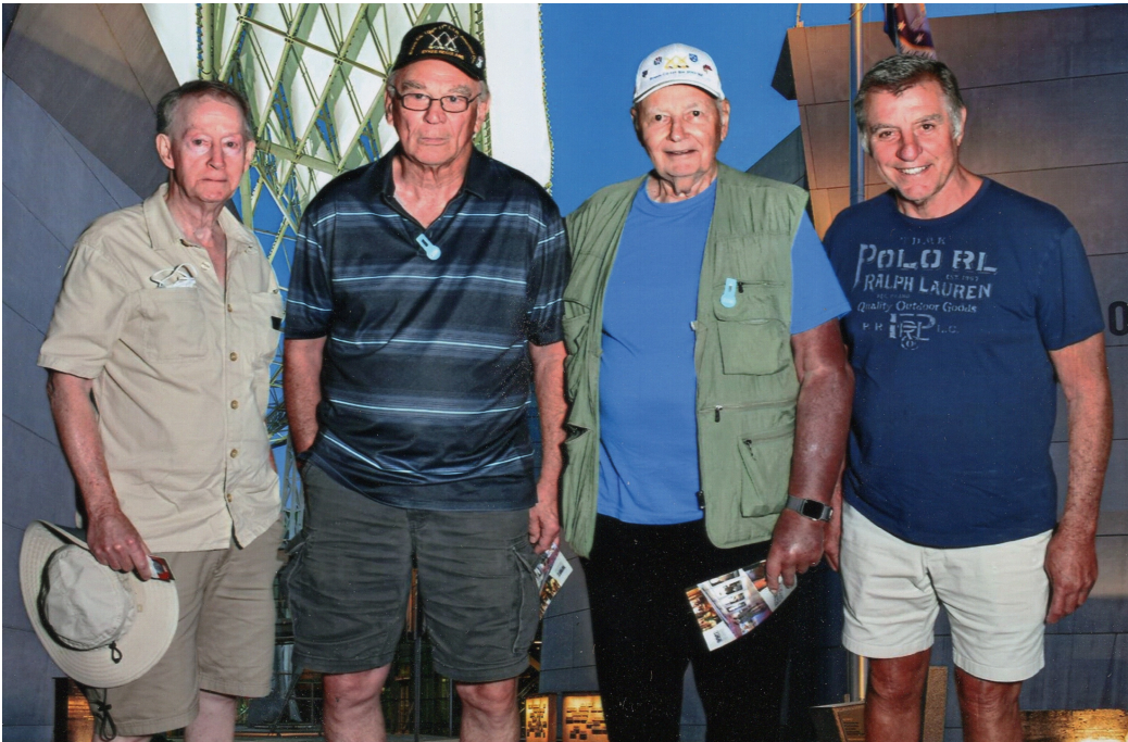
Bravo Company Reunion at the National WWII Museum, 2024