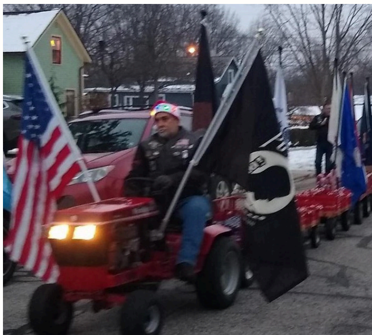
Jack Frost Festival, 2025