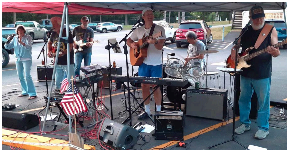
Post 91 Members enjoying Music by the Clayton Brothers on the Pavilion 2024