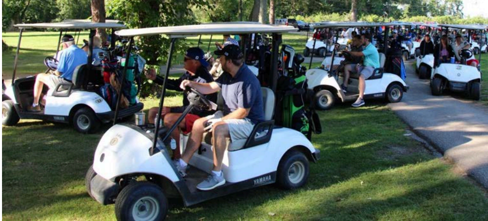
James C Masie Memorial Golf Classic, 2024